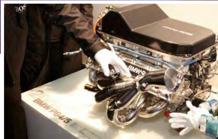
Highlight of this club tour: The Night of the White Gloves on 22 November at the BMW Museum