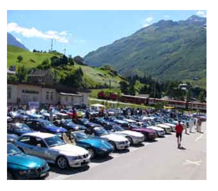
BMW Z rally to Andermatt 2004

All information is available on the website www.bmwz3club.ch and registration is also possible. Of course we are not only hoping for good weather on August 19<sup>th</sup>, 2007 in Andermatt, but also for a record number of participants.