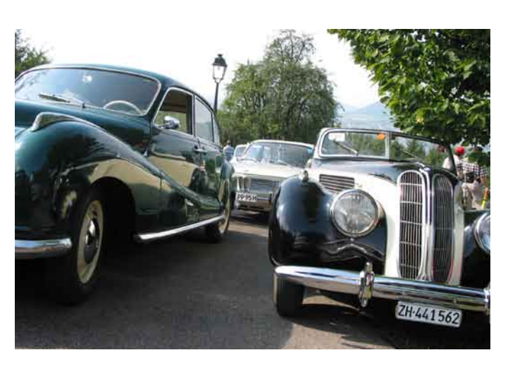
Always on show: the BMW veterans

We have new plans and ideas for the future and are currently working on a good route through the Swiss BMW Club life for our friends on two and four wheels.