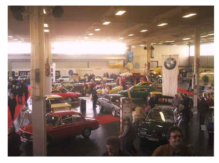
Our exhibition hall at the RETRO CLASSICS

able to be seen from a greater distance. A cross-section of 6 decades of BMW car production and a BMW motorcycle were exhibited as always. A clearly increasing interest in young classic cars is perceivable, which now includes our BMW vehicles from the Bracq era. The BMW Club stand was enhanced by the BMW Mobile Tradition (parts) counter, where a multitude of information regarding parts was available to all those interested.