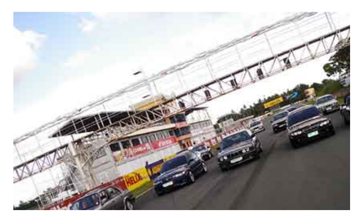
The highlight of the day the full lap exercises with the instructor

The course started out with a short classroom stint discussing driving position and how it is critical to being able to know, feel and control the machine. There were also key discussions on safety, driving technique, and basic automotive dynamics. After the classroom session, actual exercises were then commenced. Each participant took turns in doing the exercises as the instructors demonstrated and then rode shotgun during their runs. The drills started off with a short, slow speed 8cone slalom run to warm up both cars and drivers. Then it was off to the braking exercises where the course called for a sprint-and-stop from 80kph to stop. After these sets, it was time for the maneuvering exercises. Attacking the slalom area at medium speeds, the participants got to experience how the car reacted in these conditions. As the exercises went on, the participants' confidence in handling their babies grew more and more.