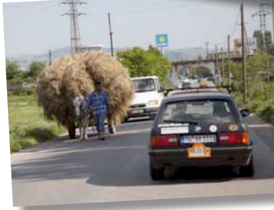
Convertible feeling in the 3 Series touring. Part of the rally route took the BMW 3 Series fleet along the coast.