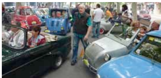
Meeting point on the Perres Ill.