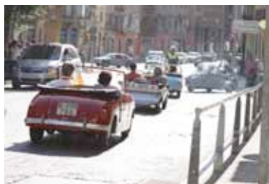
In the streets of Manresa.