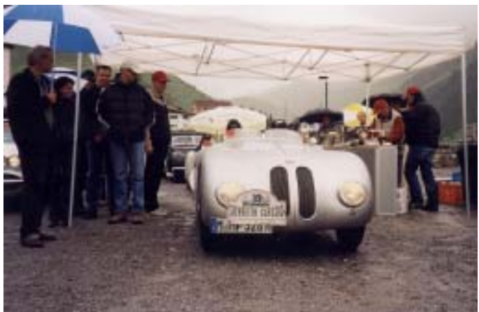
Passing through a control point: brief respite from the rain.