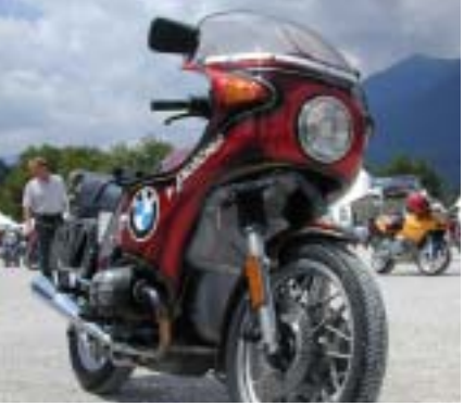
28,000 enthusiasts: Bikers Meeting.