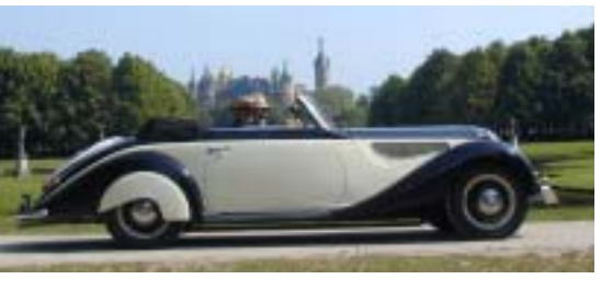
Veteran Meeting in Schwerin: perfect conditions.

Schwerin. Glorious weather and magnificent historical backdrops turned the 27th International BMW Veteran Meeting in Schwerin from 29th May to 1st June 2003 into an unforgettable experience for around 320 participants, while the hosts and their infectious enthusiasm evoked pleasant associations with the atmospheric Mille Miglia rally held in Italy.