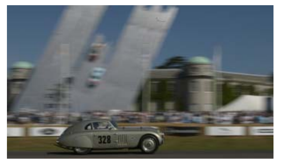
Unstoppable: the BMW 328 Mille Miglia Touring Coupé.

Goodwood. In its tenth year, the Festival of Speed held at Goodwood in southern England remained true to its tradition and once again surpassed all previous records. Attendance figures that have grown from an initial 25,000 to 158,000 enthusiastic spectators, high-calibre personalities from the world of motor racing and an unrivalled gathering of the most successful racing models of every decade of motorsport not only corroborated Goodwood's reputation as a premier international festival for classic cars and motorcycles, but also lent the anniversary event the lustre of a major social gathering.