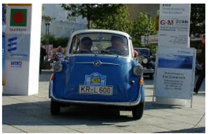
Always an eye-catcher: the much-loved BMW Isetta at the entrance to the parade.

His "sheer driving pleasure" was evident for all to see, despite the very unspringlike temperatures.