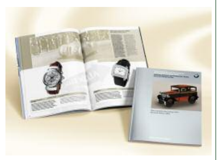
Classic BMW accessories and collectables have been available on the Internet since June of this year.

Some of the motifs have been incorporated in the design of a limited edition of mouse pads. The new edition of the catalogue also offers more new miniatures and accessories, such as three new models of the popular BMW Art Car series, designed by artists Penck, Fuchs and Nelson, cocomats for cars from the 02 Series, or the exclusive pocket umbrella with line