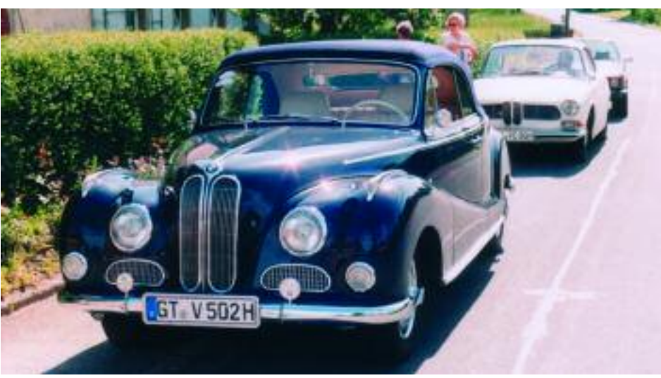
There is a large number of fans of large BMW saloons, BMW coupés and sports cars from the BMW 50 and V8 post-war era. The BMW V8 Club has an international group of members numbering 1.000 committed enthusiasts.

The BMW V8 Club presents its Internet profile with information about the big BMW saloons at www.bmw-v8-club.de.