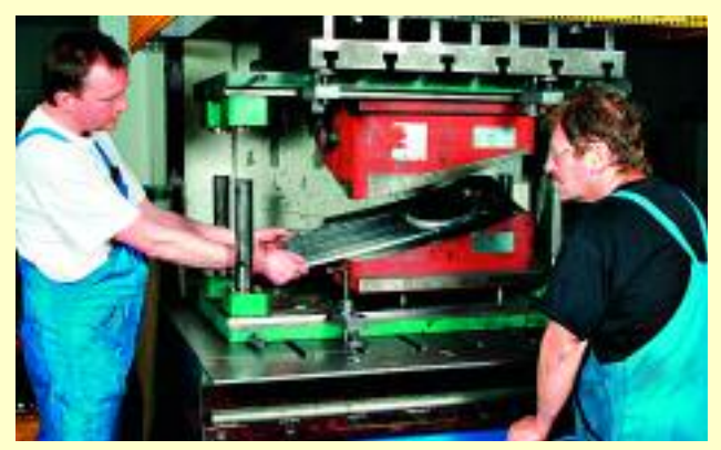
There is a complex and often long-drawn-out process involved in making an "old" spare part available. This picture shows a front trim grille being manufactured for the 02 Series on the basis of old documents. The process uses new engineering techniques to press out the grille, and compliance with the specified dimensions is checked automatically.