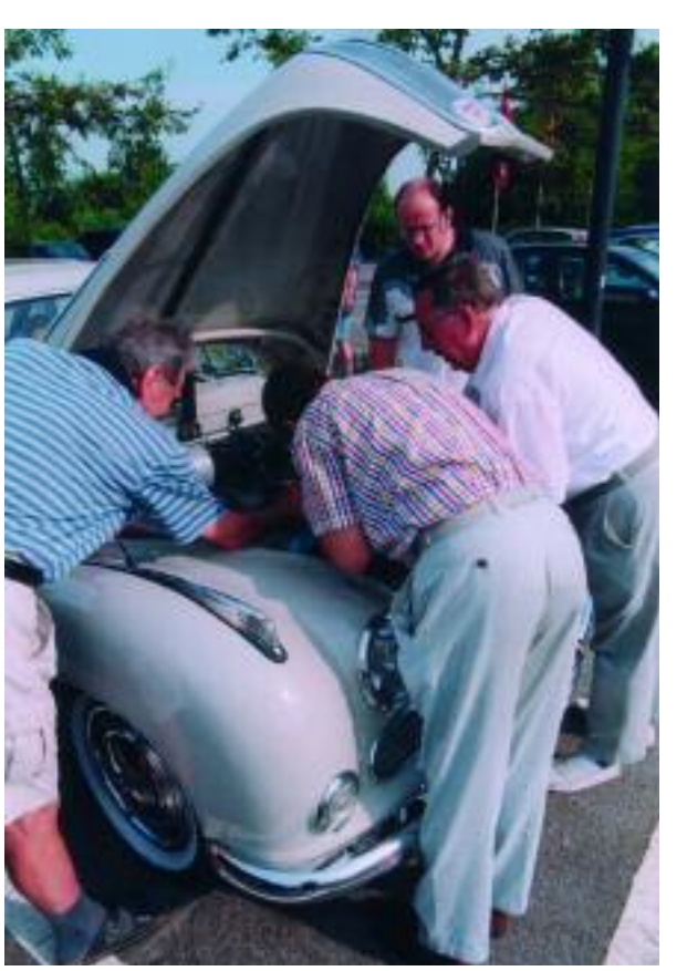
Experts at work: The members of the V8 club family have been supporting each other with advice and assistance for almost 30 years.

the global BMW club family and it believes in keeping up a high profile. The club gives a lively profile of its aims and interests on a dedicated club stand at many trade fairs. It takes a stand at fairs ranging from Motor Classics in Stuttgart, through Techno Classica in Essen, to VETERAMA in Mannheim and Technorama in Ulm. Anyone interested in the club and its activities can get to know about them in person wherever they happen to be.