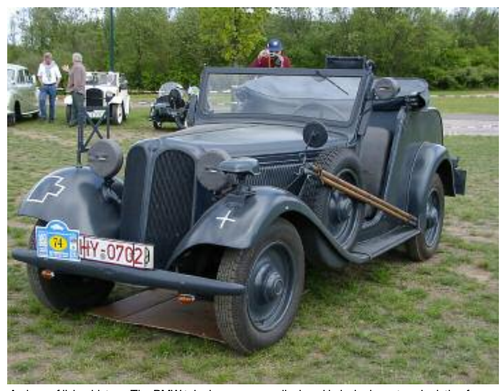
A piece of living history: The BMW telephone car was displayed in lovingly nurtured pristine form at Saarbrücken.

Although temperatures were distinctly on the fresh side, this made no impression on the 150 or so BMW cars and motorcycles and it certainly didn't put a damper on the enthusiasm of nearly 300 participants from six countries. Presentation of the vehicles in Saarbrücken and Neunkirchen and trips through the enchanting Saarland landscape provided a fascinating experience for participants and audience alike.