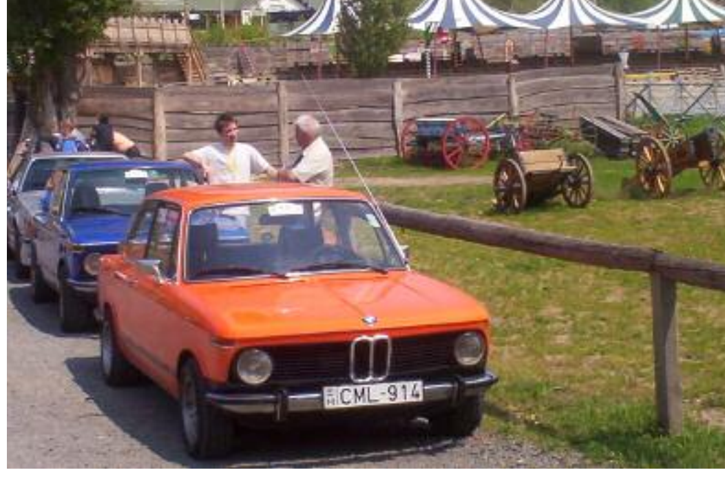
Tradition and History: BMW classics seem positively modern compared with the rustic Hungarian wooden carts.

This event offered an opportunity to meet people with a common interest from all over Europe and also to experi-