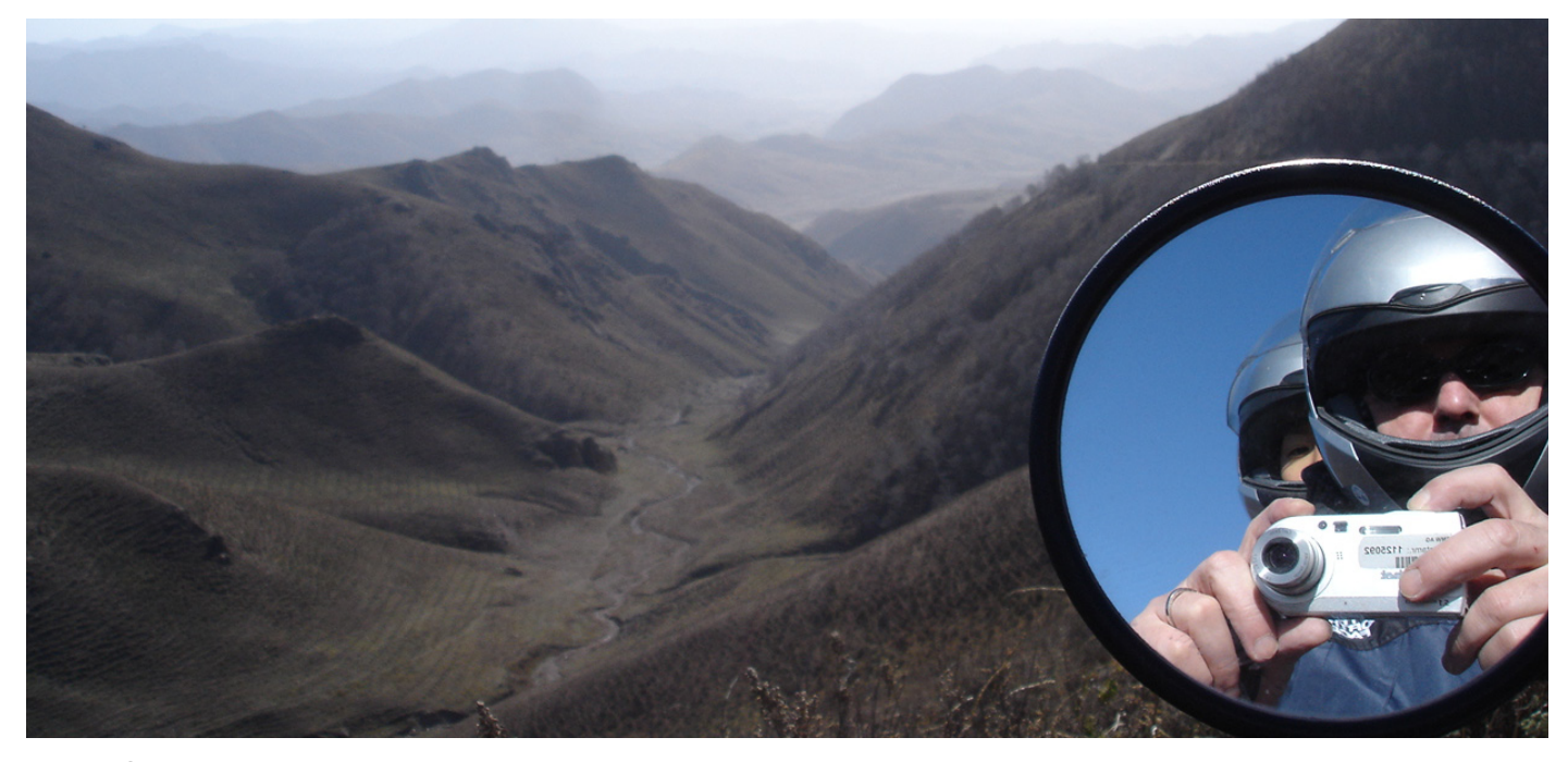
20 km before Pigtown

The village in the high plains of northern hebei province got it's name from the original "ping tou liang" and from the many pigs we spotted along the road on an off-road trip on our adventures. Untouched, not influenced by any kind of tourism and the rare occurrence of motorized vehicles make it a unique place. We believe that many locals never saw a place other than this. Leaving Beijing, it's outskirts and the great wall behind,