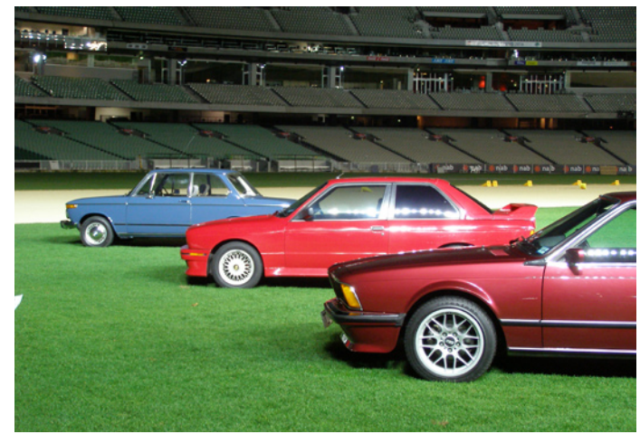
... and the 20<sup>th</sup> Anniversary of the launch of the first BMW M3