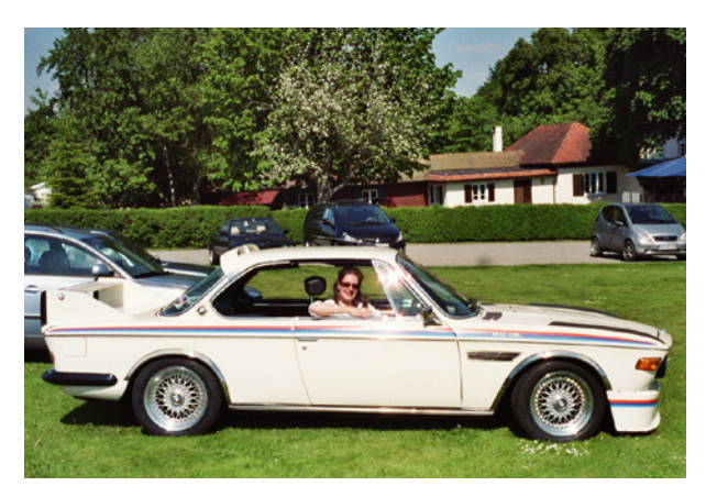
You don't want to get out anymore there.