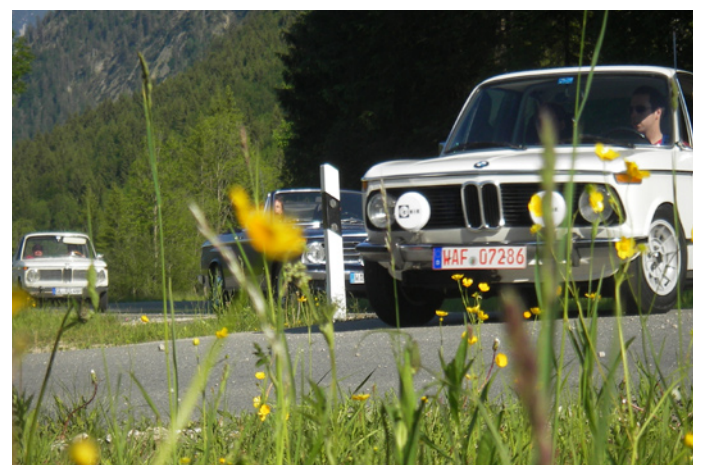
There was no lack of driving pleasure, of course, during the sunny drives through the foothills of the Alps.

BMW enthusiasts spoilt themselves and enjoyed hospitality and the most marvellous weather in the Bavarian capital for four wonderful days. The team zestfully heard many positive voices after the event: