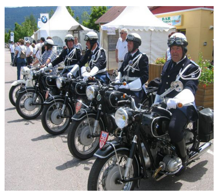
This pic of French policemen could have been made 50 years ago!