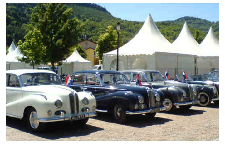
Dutch ancient on parade in Saulxures.