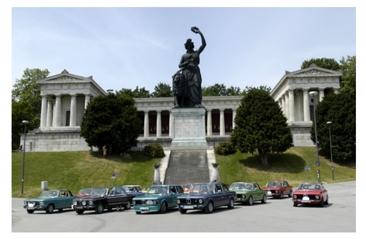
The BMW classics met at the feet of the Patrona BAVARIA on Theresienwiese in Munich.

"Many thanks from Central Switzerland. I was there for the first time and had lots of fun. I got to know lots of wonderful and very helpful people during terrific tours through magnificent countryside in beautiful weather. What more can a 02 driver wish for! Please send my thanks to the Orga Team – organising an event with more than 250 teams over four days is a fantastic achievement involving a great deal of work. I hope nevertheless that you managed to enjoy something of the event as well."