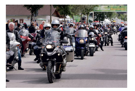
More than 800 bikers took part in a 150 km motorcycle parade from Garmisch-Partenkirchen, through Austria and back

the BCE tent. BMW Motorrad is planning to extend the club area for next year's Bikermeeting so that more countries can be present there with their BMW Clubs. If you are interested in being present with your national club or federation at the Bikermeeting