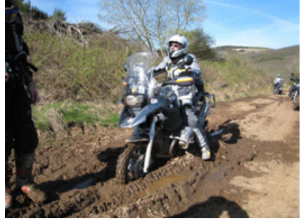
GS trip of the BMW Moto Club France in the Aveyron, May 2008

schland.de nwmoa.org www.avd.de clube31.de mwcca.org tta-club.de nwclubs.ch er-club.com mwcca.org nenclub.de eterama.de