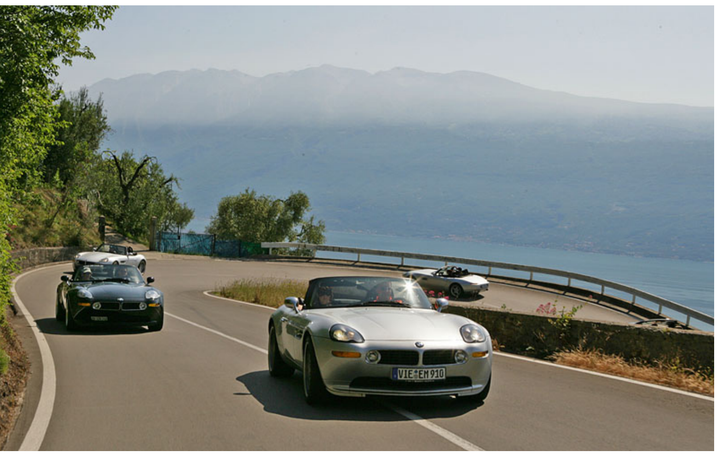
The BMW Z8 Club on its way to the Grand Prix Historique in Monaco

Newsletter of the International Council of BMW Clubs