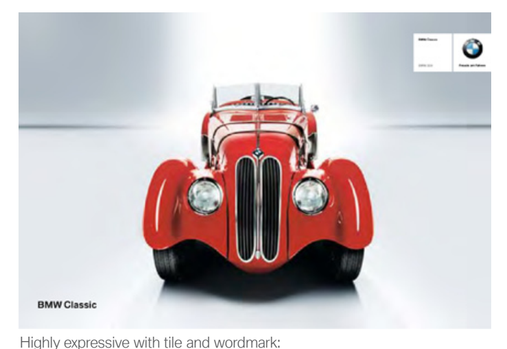
The new Corporate Identity corresponds to the current BMW CI

New goals, new strategy, new name – after the phase of establishing BMW's heritage division, a new era has now begun. It is accompanied by a growing demand in the market for historic vehicles and parts. The central challenges for BMW Classic in the future are an even stronger focus on customers, a broader range of services, and enhancement of the communicative profile.