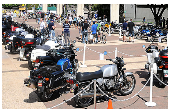
The range of BMW motorcycles in the display covered all eras

The range of BMW motorcycles in the display covered all eras with some beautifully restored classics like the BMW R 69 S and R 90 S and other examples of motorcycles that have provided their owners with many years of sheer riding pleasure without undergoing any serious work. As well there were current models, sidecars, trikes and other examples of motorcycles that had been modified to suit their owners' personal requirements. The crowd favorites were stunning BMW R 90 S, this classic motorcycle from the 1970s was the machine that changed the perception of BMW and gave the brand and the club a new lease of enthusiasm at that time.