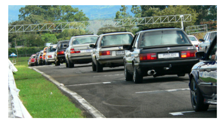
Daily drivers turned racers for one day at the La Guacima racetrack

The main spotlights of our club revolve around the two track day events held every year in February and October, a ^{1\!/}_{4} mile drag