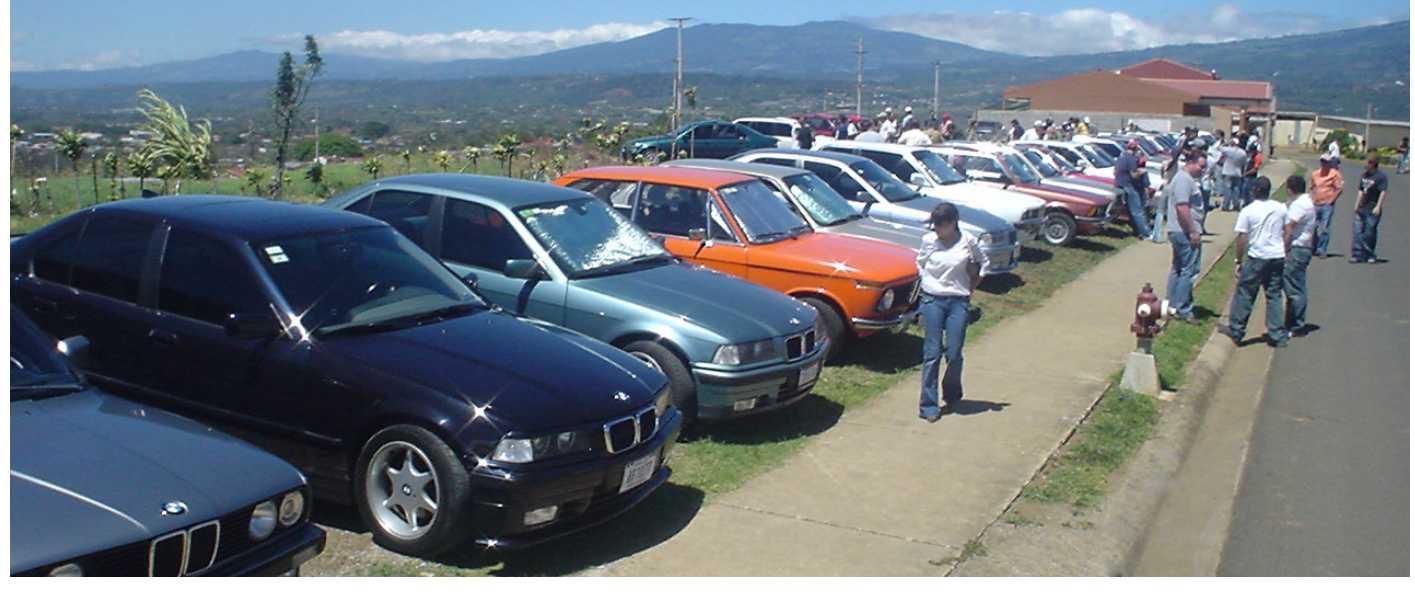
Club meeting amidst beautiful Costa Rican scenery

In June 2005 me and a small group of BMW enthusiasts met through an internet forum of a local motor sports web magazine and decided to create an online community in order to have a place to share our love for the brand. Our first meeting consisted of only four of us and in our second meeting a few weeks later we celebrated because our number had increased to seven; little did we realize that simply by word of mouth our third meeting would see our then informal community grow to a number of thirty-eight.