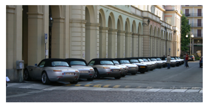
Line-up in Acqui Terme in Piemont (Italy)

Next, the group travelled over the San Bernadino through Switzerland to Acqui Terme, where we visited the picturesque Piemont, and enjoyed our first Italian evening with by now 54 BMW Z8 vehicles in attendance. The Italian authorities had blocked off an entire road to serve as our parking area, and even ensured that we were guarded for the night. The local residents, most of whom were themselves motor-vehicle enthusiasts, were amazed at the fascinating sight, which – let's face it – is a oncein-a-lifetime experience for residents of such a small town, and pounded us with all manner of questions.