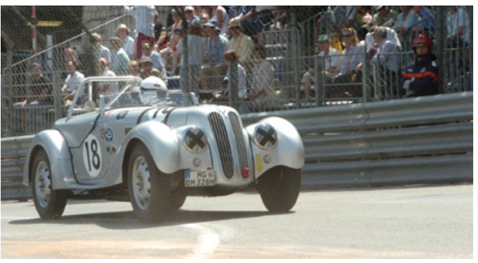
Historical BMW racing car on the streets of Monaco

8 am, the first racing cars from a bygone era had rematerialized for a chance at repeating former glories on the racing track. The hotel shook from the sheer noise emanating from their engines, which was, however, music to the ears of the hotel guests. These two days were an absolute thrill and a veritable feast for the motorsport enthusiasts and fans of vintage models, as they watched from their specially reserved "BMW Z8 Club e. V. Lounge" rooms on the fifth floor of the Loews Hotel, with a direct view of the famous Loews bend, or from their reserved places on the stand at the casino. To see and hear these vintage cars, to experience their unique smell and hear the classic sound of the engines, and then to enjoy all of this against the backdrop of the Côte d'Azur, was an absolutely unique experience.