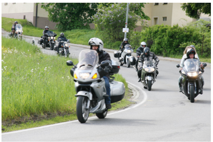
Varied tours through the Bavarian Forest, the Böhmerwald or in the Mühlviertel offered everyone a special experience

Further tours of the Bavarian and Bohemian forests were on offer on the Saturday. And then at 3 pm, we met up again in the district of Klingenbrunn for a bikers' service, which included a blessing of the motorcycles. This was also the starting point for the helicopter sightseeing trips. Following the motorcycle blessing, there was a motorcycle parade to Spiegelau, where it was time to give out the prizes at the festival site. Those participants who had travelled the furthest to be at the event, male and female, as well as the oldest participants and the best performing groups all won valuable crystal glass goblets, which had been donated by various companies. The many items donated by the International BMW Club Office were given away among the guests by lottery.