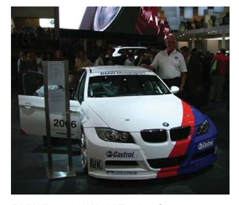
BMW E90 320i World Touring Car Championship 2006

Living down here in New Zealand in the South Pacific and being brought up as a car nut there are certain iconic motoring events that most of us can only dream of seeing. Events such as the Monaco Grand Prix, the Monte Carlo Rally, Spa 24