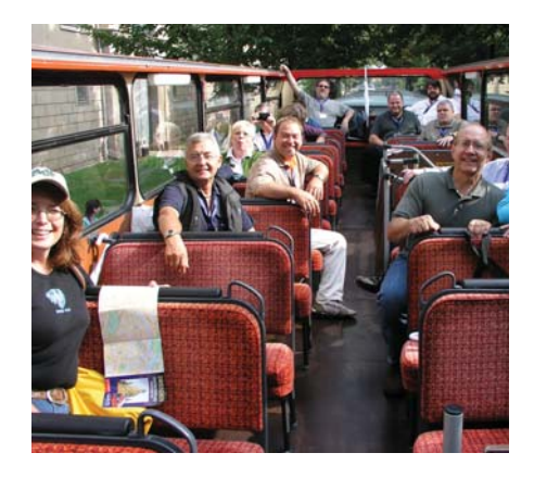
With the convertible bus through Dresden

Between work sessions, delegates enjoyed quality food in the factory canteen. As we ate and talked, assembled BMW 3-series bodies passed over our heads from body shop to paint shop. Nobody at Leipzig plant can lose focus from what they do - the product is ever present overhead. Walking to the bathroom, glass walls in the passage let one look into the final assembly and qua-