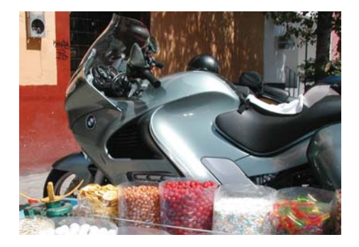
An enjoyment in every sense

www.bmw-mc-vl.be www.bmwra.org/rally www.clubbmwargentina.com.ar www.essen-motorshow.de www.retroclassics.de www.siha.de www.veterama.de