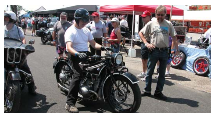
Also present was a 1925 BMW R32.

The BMW Motorcycle Owners of America hosted its 33rd annual International Rally in Lima, Ohio. For four days in July, Beemerville, USA became a reality for over 8,300 BMW enthusiasts. This year's event was attended by BMW riders from the