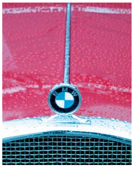
Brilliant views at the VETERAMA in Mannheim and Ludwigshafen