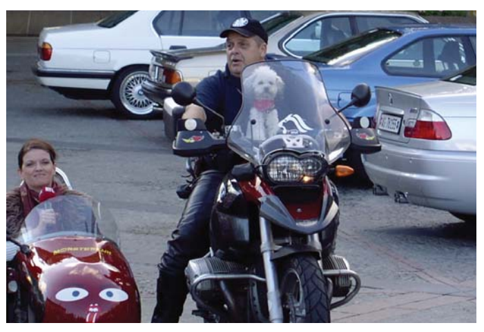
Special trip for special passengers.

expedition to Roadbook, the BMW drivers explored the green heart of Europe. Through the characteristic gentle hilly landscape in the north of Luxembourg, the participants reached the