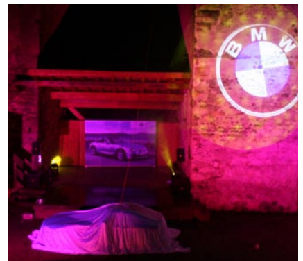
Annual meeting of BMW Clubs Österreich: BMW Austria presents new BMW Z4 M Coupé