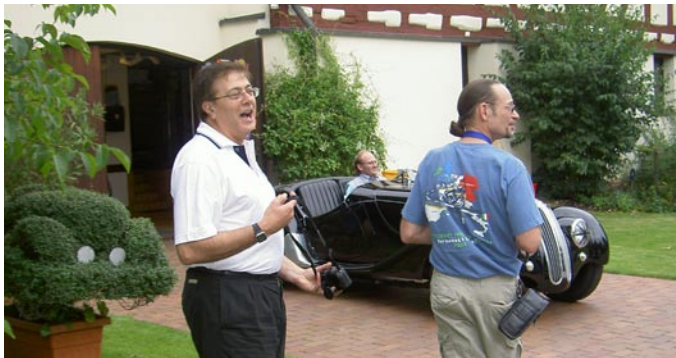
International Council Meeting 2005 in Simmelsdorf

It all began for me with a test ride in a 1978 BMW E21 320i, which we were comparing to a Porsche 911. Well, the P-car was neat and my girlfriend, now wife, managed to get a speeding ticket in it but there was something about the Bimmer which made us buy a new one. It was Sierra Beige, with tan cloth interior, sunroof and limited slip differential. I added an aftermarket sound system (Alpine & ADS) and we were blissfully happy for a couple of years. Joined the BMW Club too. Then I did a driving school with the BMW Club at Lime Rock Park and have never looked back. I caught the bug and did as many schools as I could, eventually becoming a high-performance driving instructor in the mid-1980s. I still instruct several times a year and enjoy it with the same passion as my first time on a race track.