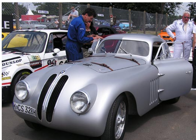
Final preparations for the manufacturer parade – Holger Lapp (Head of BMW Mobile Tradition) and the BMW 328 Mille Miglia Coupé

Before the start of the races, on Saturday, a group of 20 BMW cars were allowed to do the "parade" on the long 24h circuit.