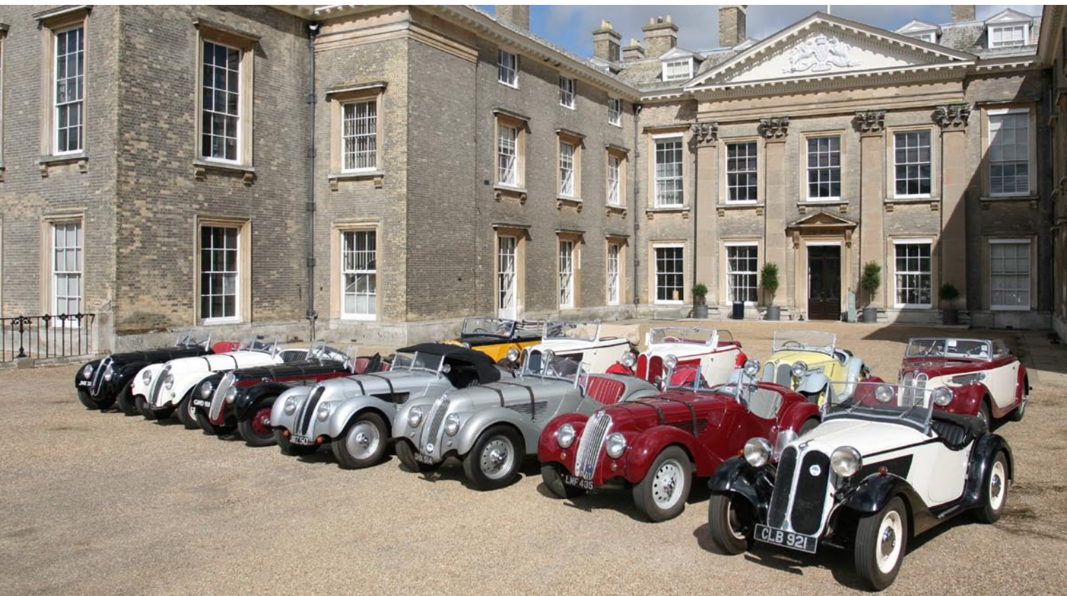
HAPPY BIRTHDAY BMW 328!

Newsletter of the International Council of BMW Clubs