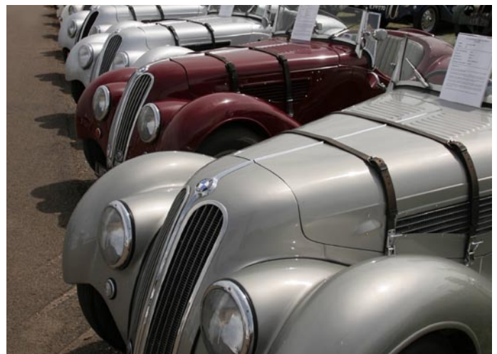
Bonnet line up.

The Club had reserved a ground floor box at Woodcote corner where light refreshments were available, together with a TV