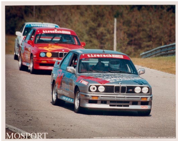
Club racing weekend at Mosport near Toronto, Canada

A few years ago, I ran in a club racing weekend at Mosport near Toronto, Canada. I don't have a lot of money to spend on racing and usually try to do it as cheaply as possible and still be competitive. Some of you would say that's impossible and actually, I can't disagree. Anyway, this weekend of racing ended with an enduro. My co-driver and I were positioned for a class win if we could find a way to get ahead of a team of experienced racers and deep pockets, also driving a BMW E30 M3.