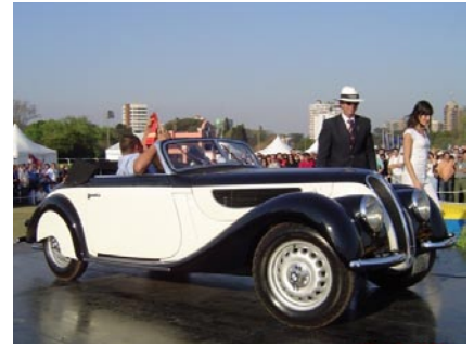
Autoclasica 2006 Argentina

You will also find a current calendar of events on our website at www.bmw-clubs-international.com