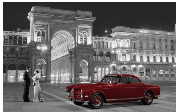
The noble classic: BMW 503 from the year 1955

The book and the film are available from the publisher HEEL Verlag in Königswinter (Tel. +49 (0) 2 22 39 23 00). The two products are available to BMW Club members as a package at the special price of 25 euros.