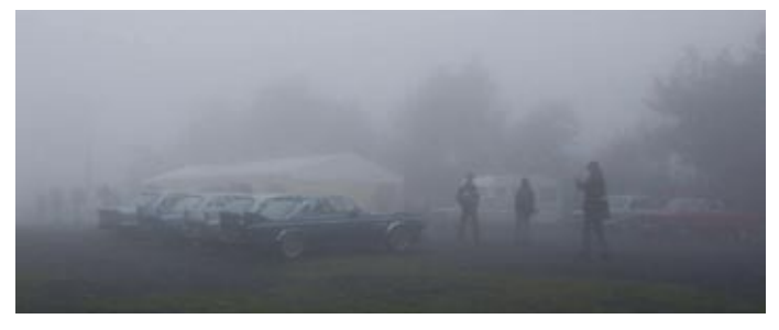
Famous Ring weather - fog all around

By the OGP Organization Team of the International BMW Classic and Type Clubs Section