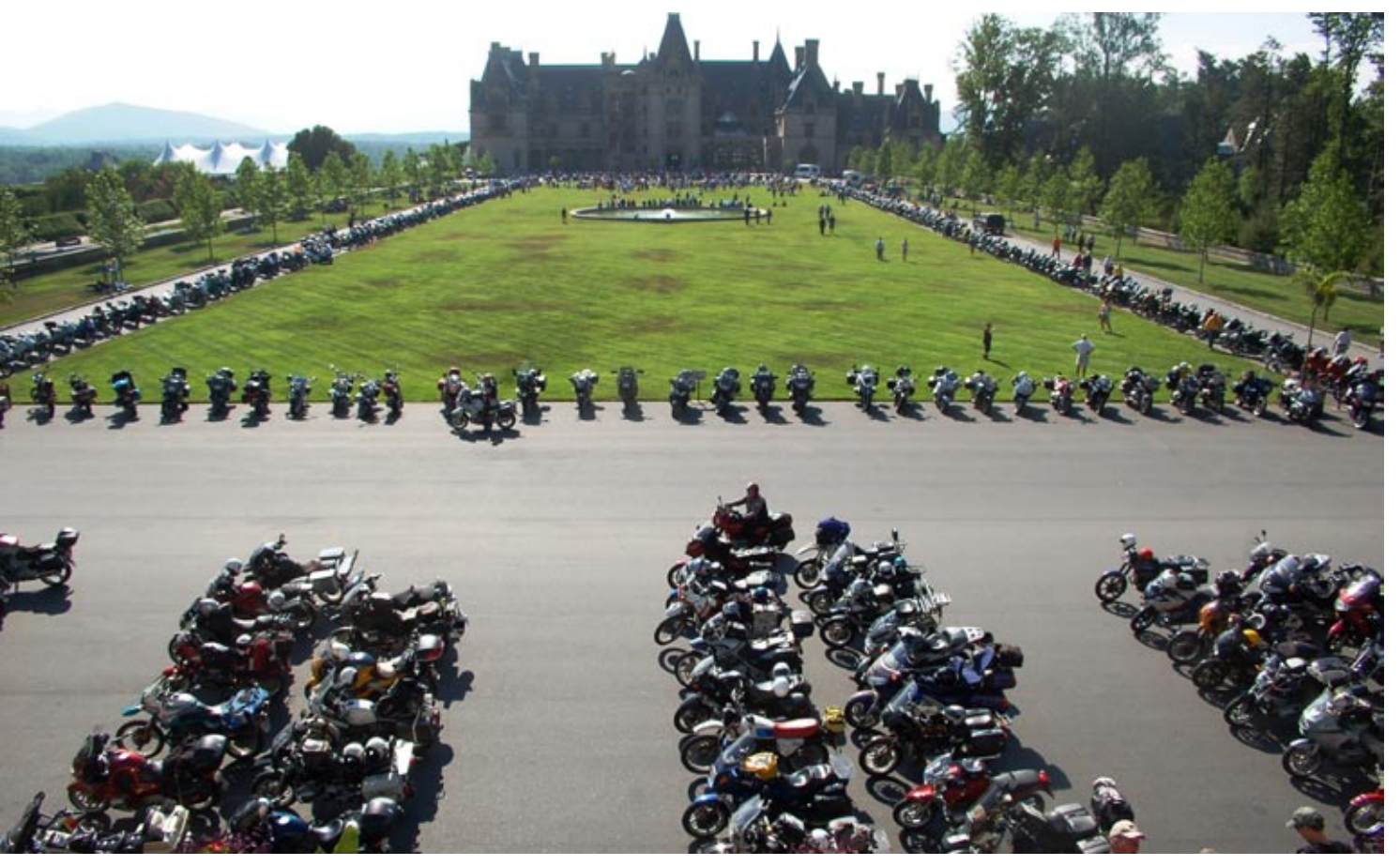
The BMW Riders Association at the Biltmore Estate

Newsletter of the International Council of BMW Clubs