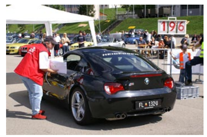
BMW Z4 M Coupé

attractive entry prizes were awarded. Unfortunately, we were not able to hold the award ceremony as planned and expressing thank to all the club helpers, fans at home and abroad and the BMW dealers actively involved. A storm gathering over the blue and white Z community forced us to speed things up. After the draw and with the storm imminent, we were forced to take our leave hurriedly and embark on the home journey. According to later reports, the various groups experienced different weather conditions. The Z3 Club was certainly able to enjoy several kilometers of open-top driving.