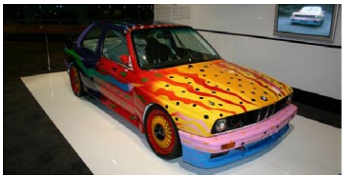
Ken Done 1989 – BMW M3

With much anticipation and fanfare the BMW Art Cars evening attracted one of the largest gatherings ever to a New Zealand BMW Club event. For weeks ahead titillating banners had decorated the streets of Auckland with pictures promoting the Bavarian automotive road show that the Auckland Museum was to display. The venue, the museum's domed events center was a fitting location for such a blend of artistic and engineering flare. The selection of vehicles chosen was equally appropriate as a sample of BMW's greatest competition machinery from an era when novel technical solutions produced gorgeous aesthetic forms to meet stiff competition from other marques. The creative additions of some of the twentieth century's finest artists further added to the dramatic shapes created by the factory.