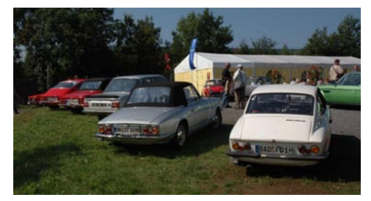
Many BMW enthusiasts came together

- at the centre of BMW Club activities for three days – could only be seen in outline. However, the mood of visitors, including BMW Club Driving Safety Training participants, was not affected in the least. There were already a large number of BMW classics to be seen (you just had to get up very close), whose owners had not been put off by the adverse weather conditions.