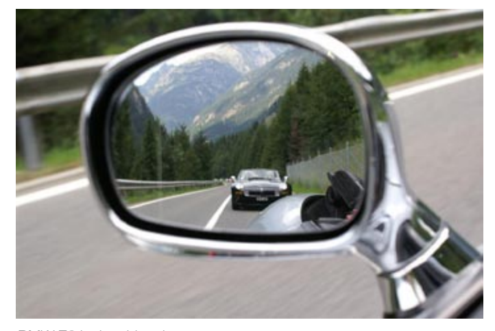
BMW Z8 in the side mirror