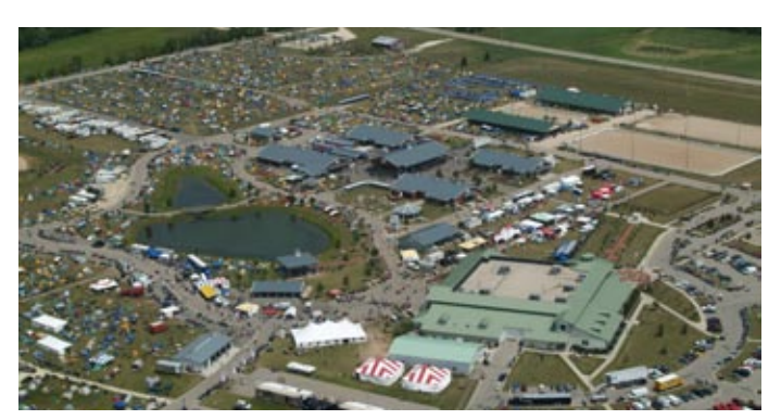
Area of the International Rally