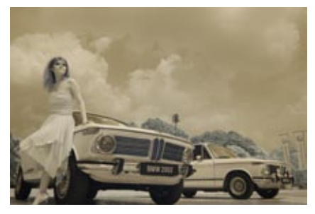
Winner picture of the "Dynamic Diva" Contest in Indonesia.

www.grossglocknertreffen. bmwklassiker.com www.bmwclubnederland.nl www.bmw-veteranenclub.de www.bmw-02-club.de/kalender.htm www.iaa.de www.bmw-mc-vl.be www.bmwcca.org/oktoberfest www.veterama.de