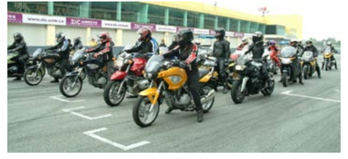
Rider training in Zhuhai International Circuit 2006

us organizing a Trans-Malaysia tour for the past two years and we are in the process of planning another for 2007.