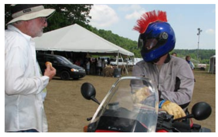
New helmet look

There were BMW bikes as far as the eye could see, with the beautiful Blue Ridge Mountains in the neat distance. For the entire four days the famed Blue Ridge Parkway was swarming with our favorite motorcycles. A lone (but much-admired) MZ4