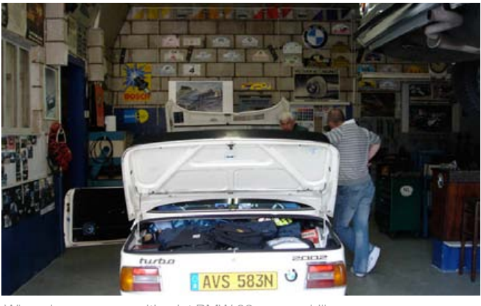
Wims dream garage with a lot BMW 02 memorabilia

about more turbos. Sunday was checking out time, but Dutch 02 enthusiast Wim offered to take us to his garage and look at my turbo. We followed Wim and then pulled into his drive way to be greeted by a massive old BMW sign on the side of a barn. Inside is Wim's workshop which is a dream garage. He has lifting hoists, pits, a floor you could eat your dinner off, wall to wall BMW 02 memorabilia, all the old BMW diagnostic equipment and a bar! How cool is that?