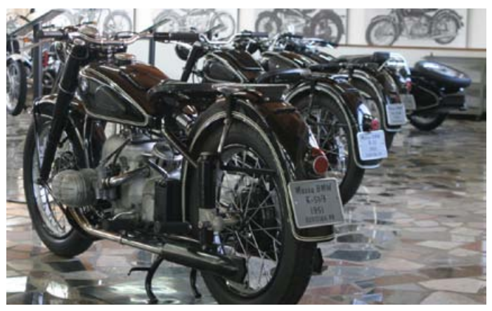
Simply fascinating - Motorcycle museum of Curitiba

Being a great success of concurrency and results, where friendship emerged instantly and spontaneously, six countries came together: Argentina, Brazil, Chile, Costa Rica, Mexico and Uruguay.