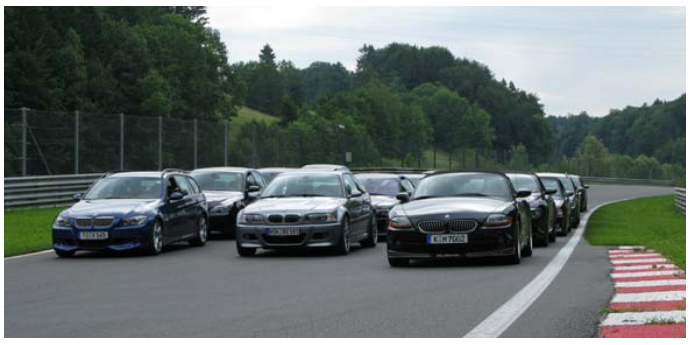
Prior to the start of the obligatory starter lap at the race track

It is now customary for the weather to have a positive impact at this summer event on the beautifully located Salzburgring. Though it was cool and rainy for days before, the clouds cleared on Saturday morning and temperatures climbed to over 25 degrees. So there was plenty of reason to be in a good mood and run a few hot laps on the circuit.