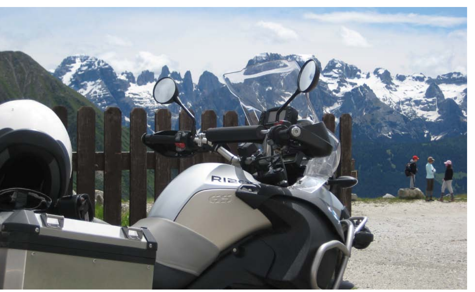
Austria - with its beautiful countryside a dream for motorcyclists

BMW Clubs International Council Newsletter