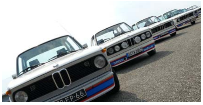
What an impressive view – the BMW 2002 cars of the club members

On the first day we had a busy schedule so we didn't really have the time to look at the car. On the Friday we drove out to the Zuiderzee Museum (www.zuiderzeemuseum.nl) via the E22/A7, a road that runs right through the North Sea for approximately 15 miles. It's a strange feeling like driving across the sea. On one side you have the North Sea and on the other a massive man-made lake.