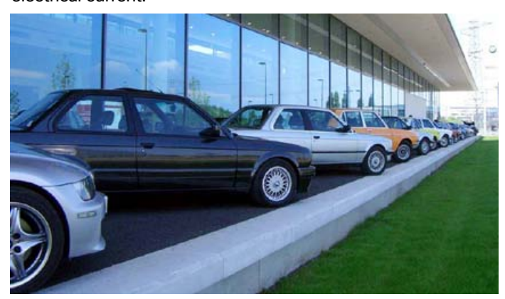
Imposing presentation of the participants automobiles

We set off again next morning. Travelling via Wuppertal and the Neandertal valley, we arrived at the BMW sales subsidiary in Düsseldorf at midday, where we were given a warm reception by the Classic Center team. After taking refreshments, admiring the new BMW Z4 and taking a special little test, we set off once again into the region, among other things passing the Gartzweiler lignite mine. Coming from the deep south of Germany, we couldn't help but be struck by this gigantic destruction of cultivated land for the purpose of generating electrical current.