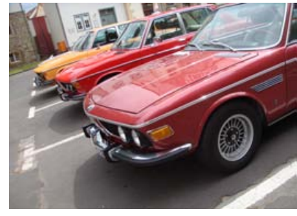
BMW classic cars of the 60's and 70's at the "Neue Klasse Treffen" in Eisenach