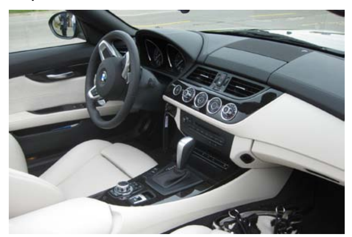
BMW Z4 sDrive 35i with 306 bhp and a torque of 400 Nm

After this introduction and a cup of coffee, the group went to the vehicles and it was time to start the ride in the new BMW Z4.