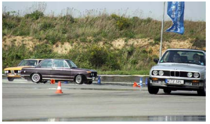
The participants had a lot of fun during the driver training course

there was no tomorrow. Refreshments were served in between - after all, those driving classic cars without power steering needed to recharge their batteries once in a while! Since the water used to sprinkle the grounds was hard, the cars were given a good wash afterwards.