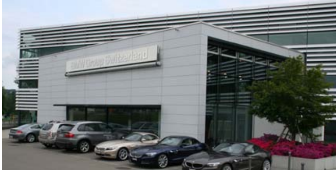
The brand new BMW Z4 in front of the BMW Group Switzerland

400 Nm at 1,300-1,500 rpm. This enables breathtaking acceleration from the very lowest engine speeds. The engine sound is something you have to experience for yourself: your heart instantly skips a beat. Gears are shifted in a fraction of a second by means of a 7-speed dual clutch transmission. Driving dynamics control permits three different vehicle set-ups: the settings Normal, Sport and Sport+ allow the accelerator pedal curve, engine management system and the DSC set-up to be altered. The sDrive 30i has 258 bhp and 310 Nm and the sDrive 23i has 204 bhp and 250 Nm of torque.