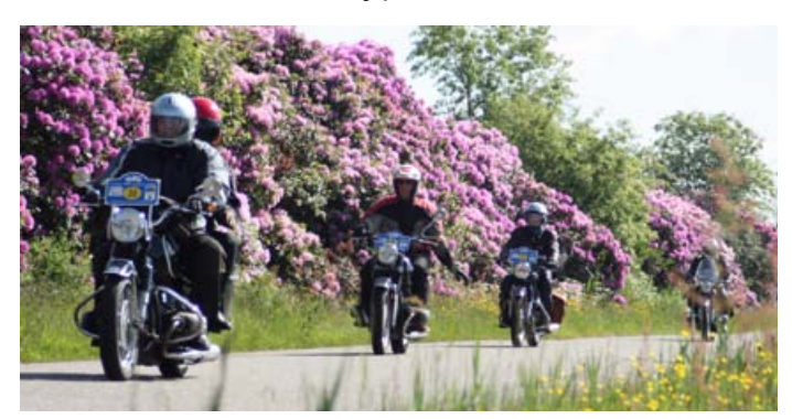
Rolling BMW Museum on the so-called German Fehn Route

Accompanied by the trumpeting orchestra of the induction tract at the rear, we glide along the so-called German Fehn Route on a band of asphalt which glimmers in the sunshine, passing dikes, meadows, hedge banks, protected moor areas and water courses. We cross navigable canals on historic folding bridges, the smooth surface of the water reflecting the BMW classic vehicles as they pass.