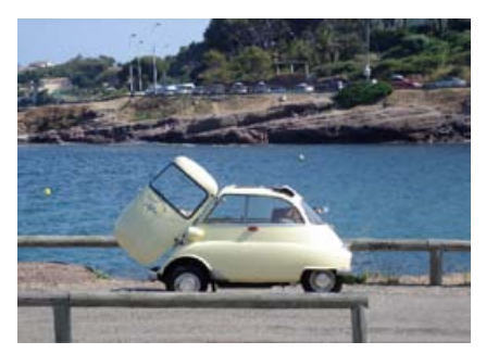
With the Isetta from Paris to southern France

www.z8-club.de www.chronoswiss-classics.de www.iaa.de www.bmwccaofest.org www.veterama.com www.classicmotorshow.de www.siha.de