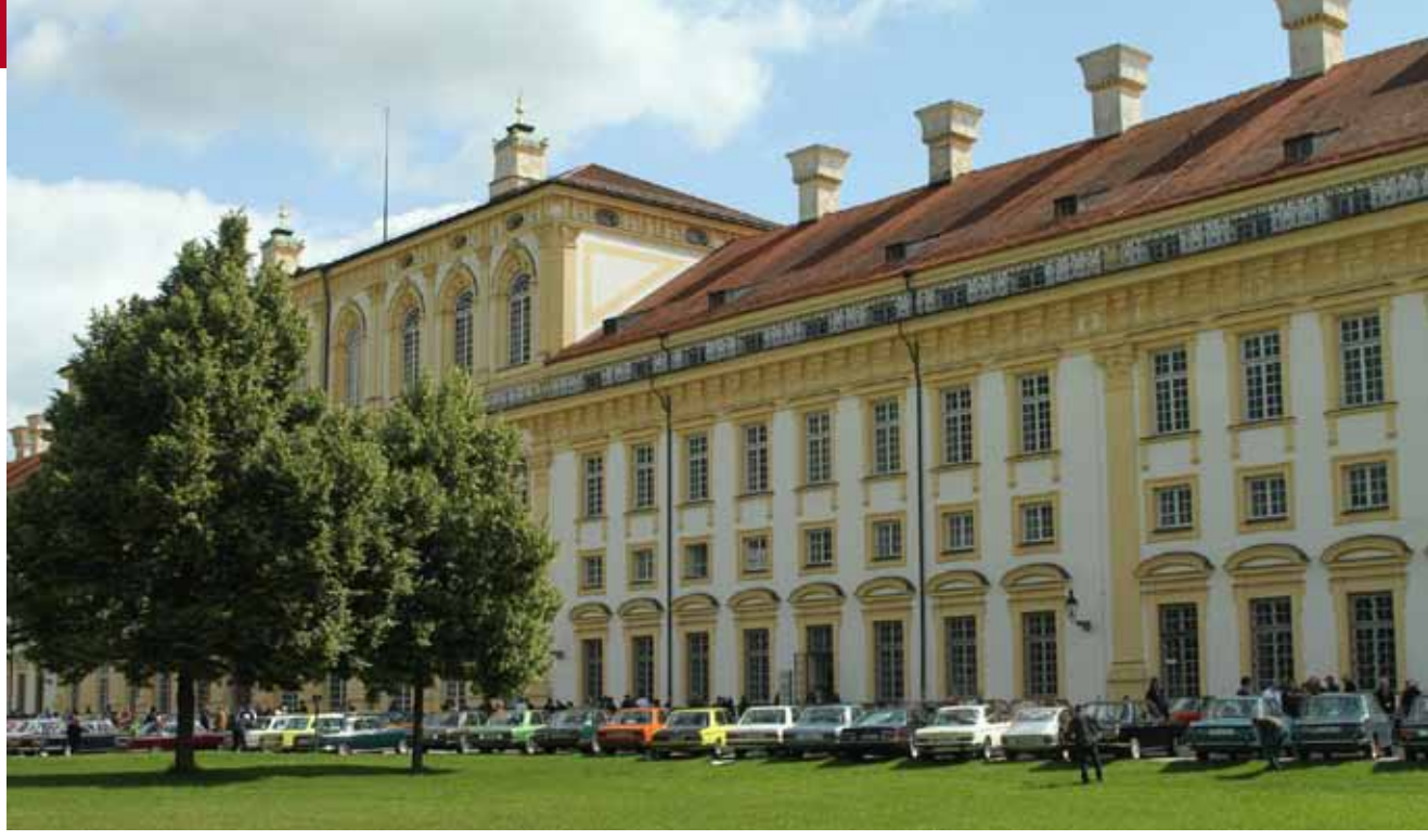
Line-up in front of the Schleissheim New Palace.