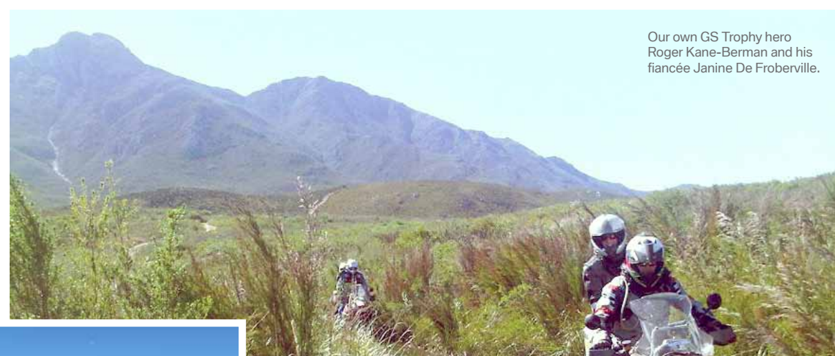
Bike traffic jam at Attakwas Pass.