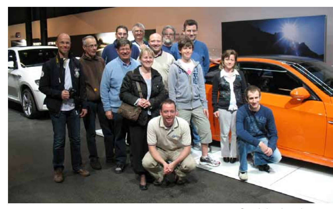
Our excited members at the BMW M Studio.

The first preparations therefore started to take shape back in January, mid-April being considered as the ideal travel period. We managed to gather a team of thirteen enthusiastic folks to enjoy the event - and no, we are not superstitious at all. It was clear that the programme had to include a tour of all the main points of interest: BMW Classic, the new BMW Museum, the BMW Welt, BMW M and the BMW Munich Plant. Admittedly, it was the team of the BMW Clubs International Office that made it all happen for us at short notice. And all our wishes were fulfilled! Unfortunately, our tight schedule didn't allow