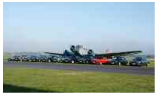
End-of-season gathering of the BMW 3 Series Club: legends of the road and air meet.