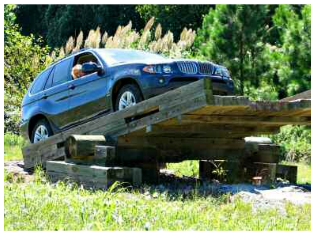
Dorothee Grau helping Phil Abrami guide an X5 up a giant teeter totter.

The front-loaded fun continued the next morning with a long interlude at the nearby BMW Performance Center, affording the Council participants extended track time in various new BMW cars. There was expert instruction in three venues, involving off-road, wet and slippery skid pad work, and dry (time trial) conditions. Wide grins were the order of the this glorious Sunday – at least until later when the group adjourned to a very "authentic" South