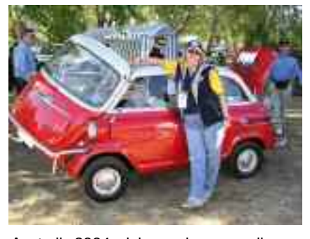
Australia 2004: club members proudly present their gems on wheels.

http://www.bmwmotoclub.com.sv http://www.classicmotorshow.de http://www.messe-stuttgart.de/ Retro http://www.ami-leipzig.de/ http://www.siha.de/ http://www.veterama.de/ index1.html http://www.millemiglia.it http://www.bmw-motorrad.de/de/ de/index.html http://www.messe-duesseldorf.de/ http://www.bmw-club-europa.org/ deutsch/veranstaltungen/ index.html http://www.iaa.de http://www.tarheelbmwcca.org/ oktoberfest.htm