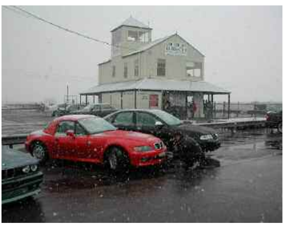
Australia with a difference.

But in July this year the weather showed what it really could be like – downright un-Australian, more like Austrian. With snow, sleet and temperatures hovering around freezing point, getting heat into tyres and brakes proved impossible. Conditions were so treacherous, the day was abandoned due to safety concerns. Few people complained as they thawed out in the comfort of a heated car on their way home to compete another day.