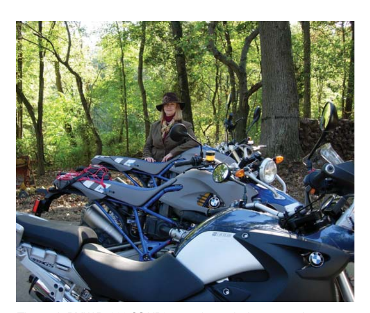
The exotic BMW R1200 GS HP2 wowed even the horse crowd in Tennessee.

Just a hour's ride south of Nashville, in Shelbyville, Tennessee, surrounded by prim barns and spotless stables, 1,700 BMW motorcycle fans assembled for all over North America and beyond. They were rewarded by a unique rally site, numerous vendors, and a fleet of brand-new demo BMWs courtesy of