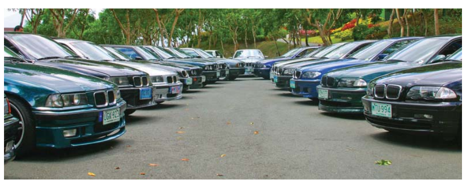
Club vehicles line up.

activities whilst encouraging safe and skillful driving. The vision was to enhance the skills of the BMW driver so that he or she can enjoy to the maximum the ultimate dri-