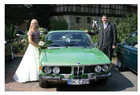
A special vehicle for a special occasion.