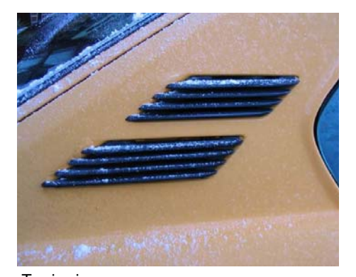
Touring in snow.

www.bmwmotoclub.com.sv www.classicmotorshow.de www.classicmobil.de www.retroclassics.de www.siha.de www.bmw-mc-vl.be www.veterama.de www.technorama.de/ulm www.bmw-veteranenclub.de www.bmw-02-club.de www.bmw-club-europa.org