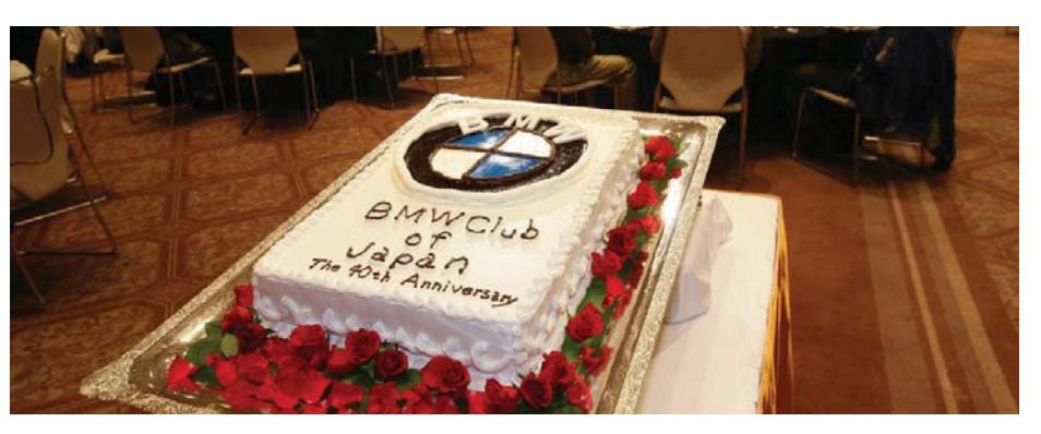
The anniversary cake.

celebrate the 30th anniversary of the debut of the BMW 3 Series. The event took place at Yatsugatake Plateau in Yamanashi