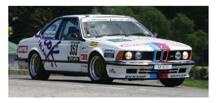
Targa 2005 New Zealand.

the Wairarapa & the Southern Hawkes Bay through some of the most amazing scenery this country has to offer.