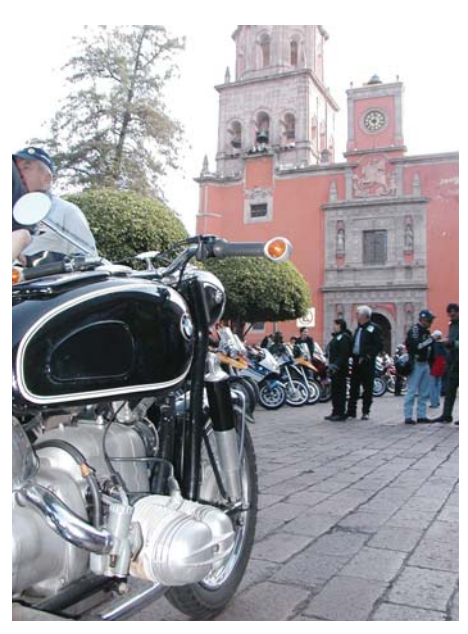
The town of Queretaro.