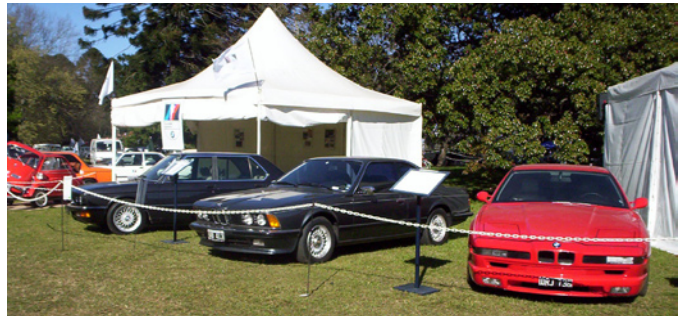
The cars of several club members shone in the Argentinean sun