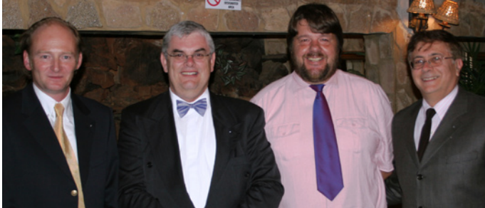
Manpower: our Board members at a glance