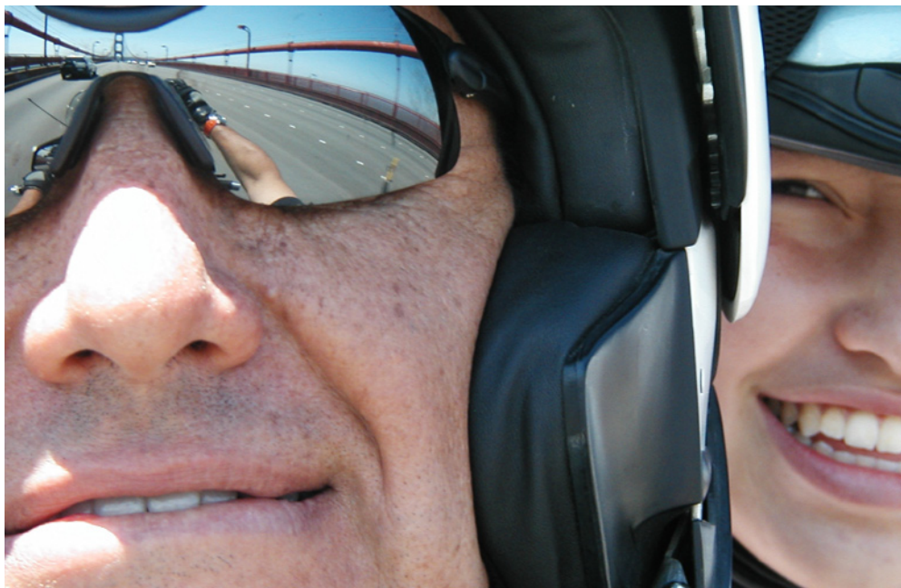
Enjoying the ride

be enough, but on a motorcycle you can go from one place to another very easily. We saw most of the interesting sites there. The bridges, museums, parks and some unique attractions such as Twin Peaks, Fisherman's Wharf, Cliff House, Sausalito and more make San Francisco a delight.