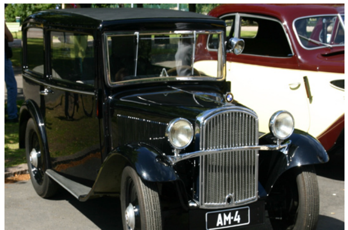
The oldest model AM-4

Almost three hundred stickers with a special 15 th anniversary logo were distributed, one for every BMW. So at least that was the amount of cars that were present. More than 600 club members visited the area. All records of their own sort. After the outdoor gathering, the event continued at the Rantapuisto Hotel where the general meeting was held. The club board presented it's current outlines and plans for club activities and additional topics pointed out by club members were discussed. Overall the meeting was very unanimous, in conclusion it can be stated that the current way of working and the board plans are well received. The evening continued with a "standard" program, dinner and sauna. During the next day some most active club members continued to discuss forthcoming club activities and implementation plans. The discussion will continue later during the autumn, in a meeting for club section heads.