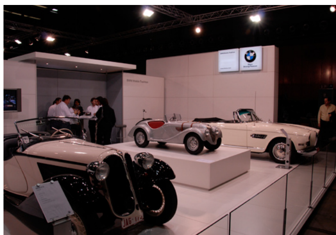
BMW Mobile Tradition presented historical BMW cars

The stand was built in a U shape, offering two different approaches and two different themes. The BMW Mobile Tradition side showed historical BMW cars. The other side was all about the BMW 02, which was no coincidence since it was the 40 th anniversary of this model. Although the model was very popular and still many of them are to be found on the roads, we found some special models which were especially appreciated by connoisseurs, such as the BMW 2002 Diana (of which only 12 were built), a BMW 1600 Karmann (unique model) and the BMW 1600 Baur (exclusive colour “maisgelb”).