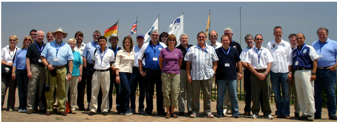
International Council Meeting attendees 2006 in South Africa