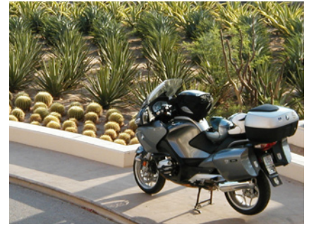
Desert Garden in La Paz (p. 08)

You will also find a current calendar of events on our website at www.bmw-clubs-international.com