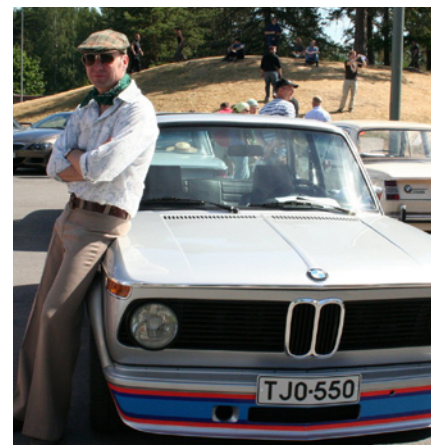
Contemporary partners at the BMW Club Finland's 15 th annual meeting (p. 03)