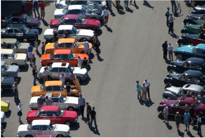
From a distance - everything looks nice