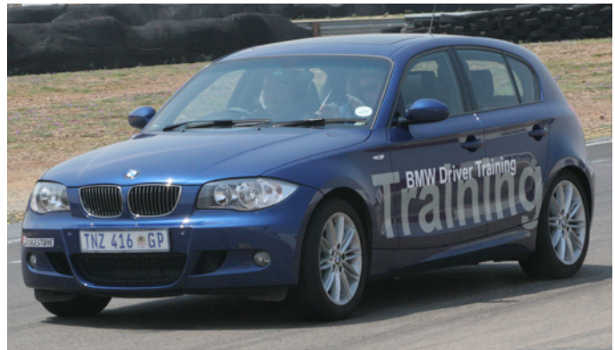
On the Zwartkops Raceway

What turned out to be an exceptional event was a South African barbecue hosted by the Menlyn car dealer. It provided an opportunity to meet BMW Clubs Africa members as well as the local club committees, namely BMW Car Club Gauteng, BMW MCC Pretoria and BMW MCC Central. The Council Meeting attendees’ feedback was that it was great to meet some local owners! Zwartkops Raceway outside Pretoria, a very short and tight track more suitable for Boxer Cup racing, was next on the agenda. Hosted by the BMW Driving Academy using BMW 130i, 330i as well as BMW M3 cars and Minis, the participants were taken through a number of exercises. A special treat was provided by the local clubs showing off their vehicles in a concourse.