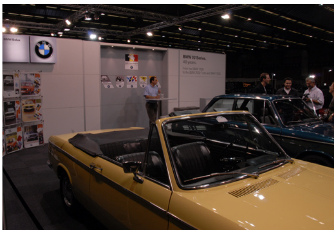
BMW Clubs Belgium stand at the Brussels Retro Festival

Located in the heart of Europe, our small country offers an exceptional range of cultural diversity. This can also be said of the BMW Clubs. BMW Clubs Belgium, the national umbrella, has 5 member clubs, which each have a specific target group. There is one specific classic car club, the BMW Bavaria Club Belgium, but all clubs have classic car interests. So for the major classical event in Belgium, the Brussels Retro Festival, all clubs join forces. Under the patronage of BMW Clubs Belgium and the support of BMW Belux – the national BMW subsidiary – an exceptional teamwork results in a great presence and a fine show on how BMW and BMW Clubs cooperate.