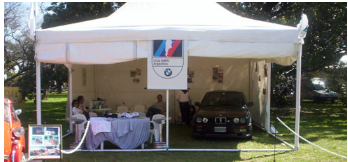
The club stand – contact point for club members and visitors