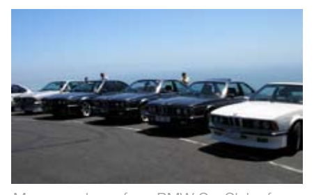
M-powered cars from BMW Car Club of Victoria at Arthur's Seat.