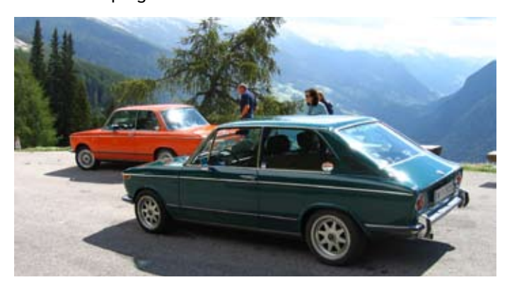
BMW 02 and 02 Touring in the sunny province of Carinthia

From September 2<sup>nd</sup> – 9<sup>th</sup>, BMW classic cars of all types came together for the first time for a very special event in Kaprun/ Salzburg: it was planned as a late summer vacation week amid the Alps with sunshine, a blue sky and warm weather – a chance to get to know drivers of other BMW models. However, things in fact turned out quite differently, at least in terms of the weather. While the weather on the weekend and on Monday was in line with expectations, the Tuesday was anything but: a sudden burst of winter put the organizers and teams to the test. All in all, 50 teams with their BMW and GLAS vehicles enjoyed an exciting and unusual programme.