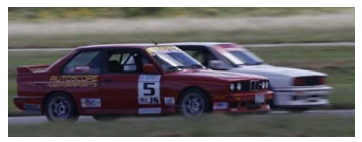
Sprint race during CCA Racing weekend at Texas Motorsport Ranch

The BMW Car Club of America's annual Oktoberfest is a celebration of all things BMW. This year's event was from September 29<sup>th</sup> to October 5<sup>th</sup> in historic Fort Worth, Texas, a former wild west cow town that has grown into a cosmopolitan center of art and entertainment. The honored BMW for Oktoberfest 2007 was the BMW E30 M3, so it was appropriate that a BMW E30 M3 scored overall wins in two sprint races during the BMW CCA Club Racing weekend at Texas Motorsport Ranch.