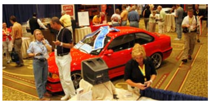
BMW CCA Oktoberfest 2007

Later on Sunday evening, the Opening Reception at the Fort Worth Hilton brought together hundreds of BMW CCA members, vendors, and sponsors. Throughout Oktoberfest, after each day's driving events, participants gathered for a reception or dinner, to socialize, discuss the day's activities, and most importantly, meet with old friends and make new ones.