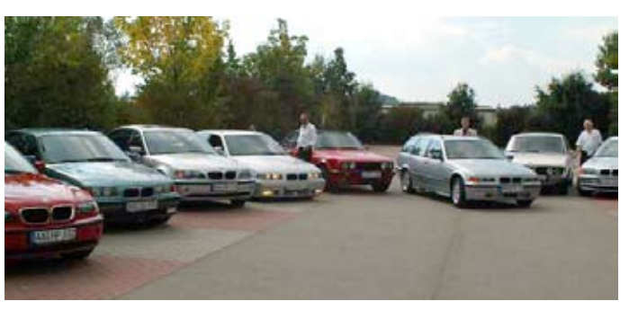
Part of today's club

young and old, singles and families, old and new BMW vehicles are represented and are indeed always welcome. The BMW Club is of course open to all motorcyclists, too. Club life has many different faces. It starts with the monthly club evening where particular importance is attached to spending fun time together and maintaining friendships. Then members are offered tourist excursions, both locally and further afield, including hikes, excursions lasting several days at home and abroad and participation in the international meetings of the BMW Clubs. Barbecues, bowling afternoons, a Christmas party and much more round off the club's annual program of events. So this is not a brand club or a motor racing club – it is first and foremost a club for the whole family and for all BMW enthusiasts. The motto for all those interested is: "Come as a guest and stay as a friend."