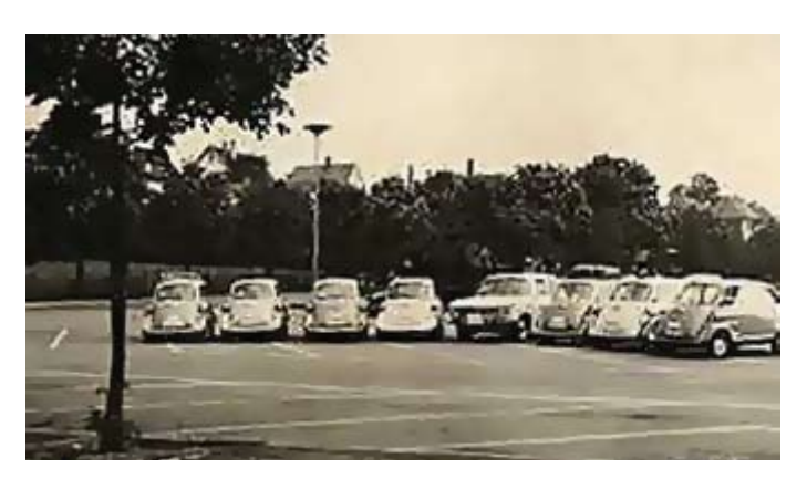
How everything began in 1957

At the beginning of 1957 a small group of Isetta enthusiasts from the area of Gmünd met to spend their leisure time together with their cars. In September of that year the Isetta Club Schwäbisch Gmünd was founded.