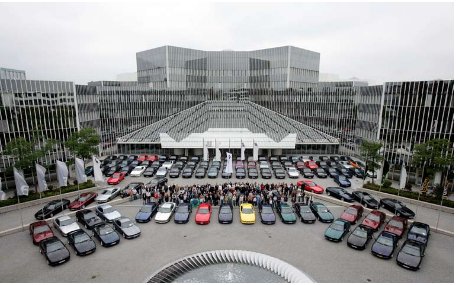
Nearly 200 attendees with their beloved 8 Series vehicles in front of the BMW Group Research and Innovation Center

Newsletter of the International Council of BMW Clubs