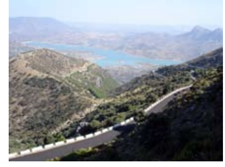
Wonderful motorcycle routes in Andalusia

www.siha.de www.m-club.de www.bmw6er-club.com www.glasclub.org www.bmw-v8-club.de www.bmw-coupeclub.de www.z3-roadster-club.de www.clube31.de www.bmwvccca.com www.bmwvclubs.ch