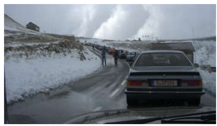
Drive-up to the snow-covered Großglockner