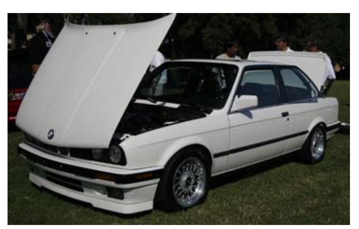
Judging in the concours

the course, and penalties were added for cones that were hit. The competition was fierce, but fun. Attendees gathered back at the hotel on Monday evening for the reception sponsored by the vendors who displayed their goods and services. On Tuesday evening, the Michelin reception honored the BMW E30 M3. The BMW CCA Foundation ran their Street Survival School on Wednesday, sponsored by the Tire Rack and Michelin. This program, now nationwide, teaches teen drivers how to better cope with the dangers of everyday driving by training them in car control, judgment, and emergency situation responses. The festivities moved to Billy Bob's Texas honky tonk on Wednesday night, featuring a barbeque sponsored by Autobahn Motorcar Group of Fort Worth. Highlights included line dancing and riding the mechanical bull. For the precision drivers, Thursday was the Time, Speed, Distance Rally. Forty-six teams took to the Texas roads, pitting their driving and mathematical skills against the rally master's perfect time. Judging in the concours began Friday morning, with cars displayed on the Kimball Art Museum's beautiful lawn. Sponsored by Griot's Garage, the event drew gorgeous examples of BMW vehicles including a 1958 Isetta, 1967 BMW 1600, and a variety of BMW coupés, sedans, roadsters, and M cars.