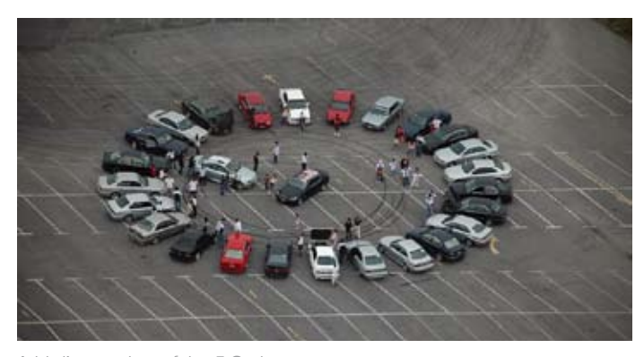
A bird's eye view of the 5 Series gang