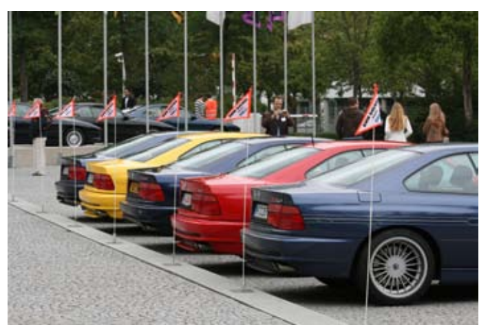
Colorful line-up of 8 Series vehicles