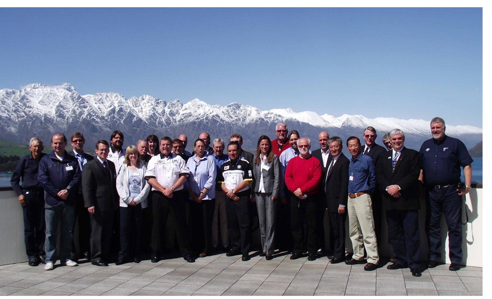
The participants of the International Council Meeting 2010 in New Zealand

BMW Clubs International Council Newsletter