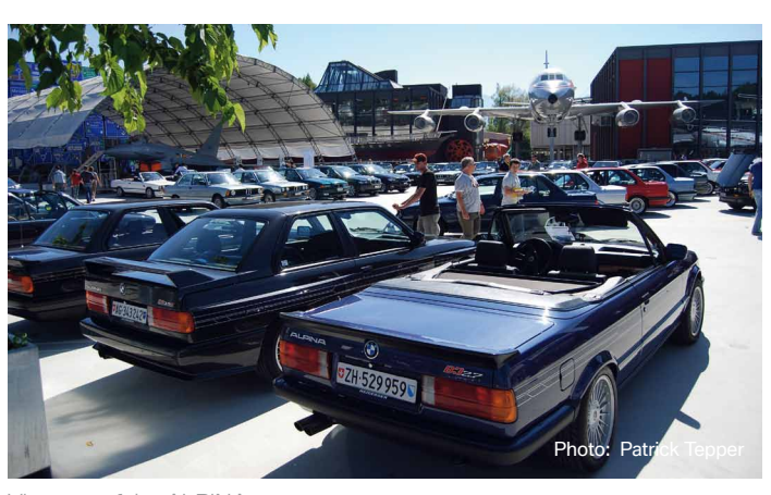
View out of the ALPINA corner

Just a short time later, the doors to the inner courtyard opened exclusively to our BMW 3 Series E30 cars, and a convoy of about seventy vehicles advanced in order to their assigned presentation spaces. After a few minutes, the engines of our cars went silent. As if by magic, the 3 Series BMWs arranged among the permanent displays likewise transformed into exhibition objects.