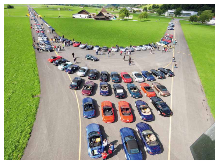
A fine view - the BMW Z vehicles from a distance

Set up in 1999, the club has now organised its seventh BMW Z Rally. Originally a BMW Z3 Club, since 2004 we have been catering to all BMW Z drivers (Z1, Z3, Z4, Z8) who want to share their joy of driving with others. We not only share our joy in driving, but also our friendship.