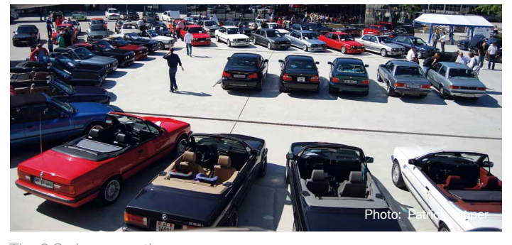
The 3 Series generations

As the central highlight, the internal club organisational committee (OC) collaborating with the Swiss Museum of Transport were able to offer a very attractive option: on Saturday, 11 September 2010, the cars could be seen in the inner courtyard of the Swiss Museum of Transport.