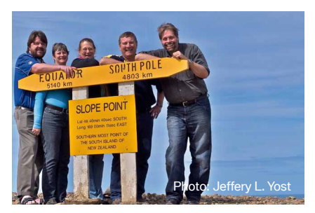
Five friends in New Zealand