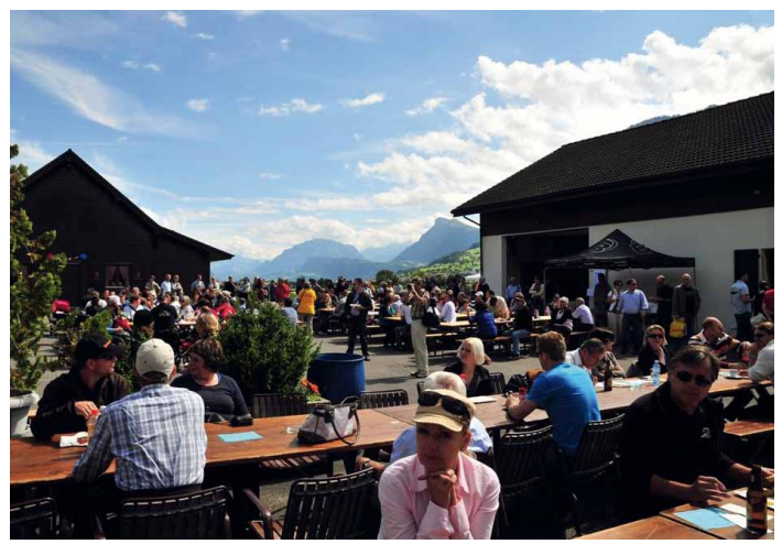
Stopover with panorama view

On Sunday, 29 August 2010, this year's BMW Z Rally brought Z fans to the foot of the Bürgenstock in Switzerland. The meeting was held under the motto "15 years of BMW Z3 – the joy of reunion".