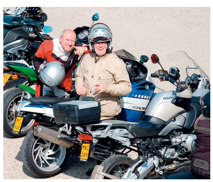
One of the activities on offer – the test rides