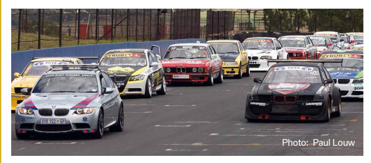
BMW Track Day

the Italian V8 Superstars, it definitely meets the necessary FIA safety standards. Should you get it horribly wrong, though, you'll be sure to bend some metal.