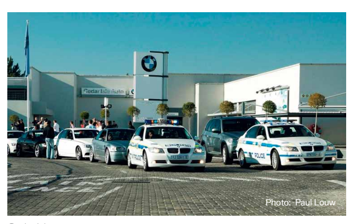
Cedar Isle run

The day was glorious, the cars even more so and everyone's spirits high. Not only were the cars going on the run a great reflection of the BMW brand, but the dealership had organised a marvellous static display. Members were treated to a BMW E30 M3, a number of BMW 2002 and Isetta derivatives, some historic and relatively new-age race machines and the highlight, a very rare BMW M1! This was a truly special display seeing as the BMW E30 M3 was never officially sold in South Africa and the only BMW M1 example in the country was kindly offered up for display by BMW SA themselves.