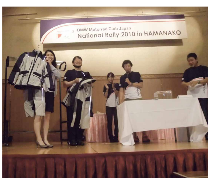
The happy winners of the BMW Santiago suits

For further information, please email bureau@bmw-moj.org