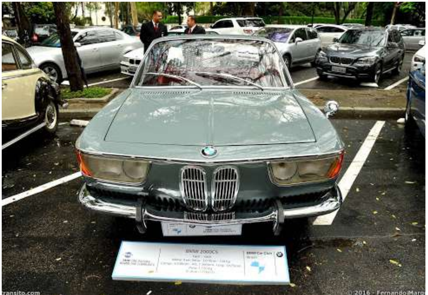
Exposición BMW 100 Años - Shopping Iguatemi São Paulo - Sep 2016

In 2019, the BMWCCB received a new and updated Certification from BMWCLAF - BMW Clubs Latin America Federation, reiterating its position as the only Official BMW Club of Cars in Brazil.