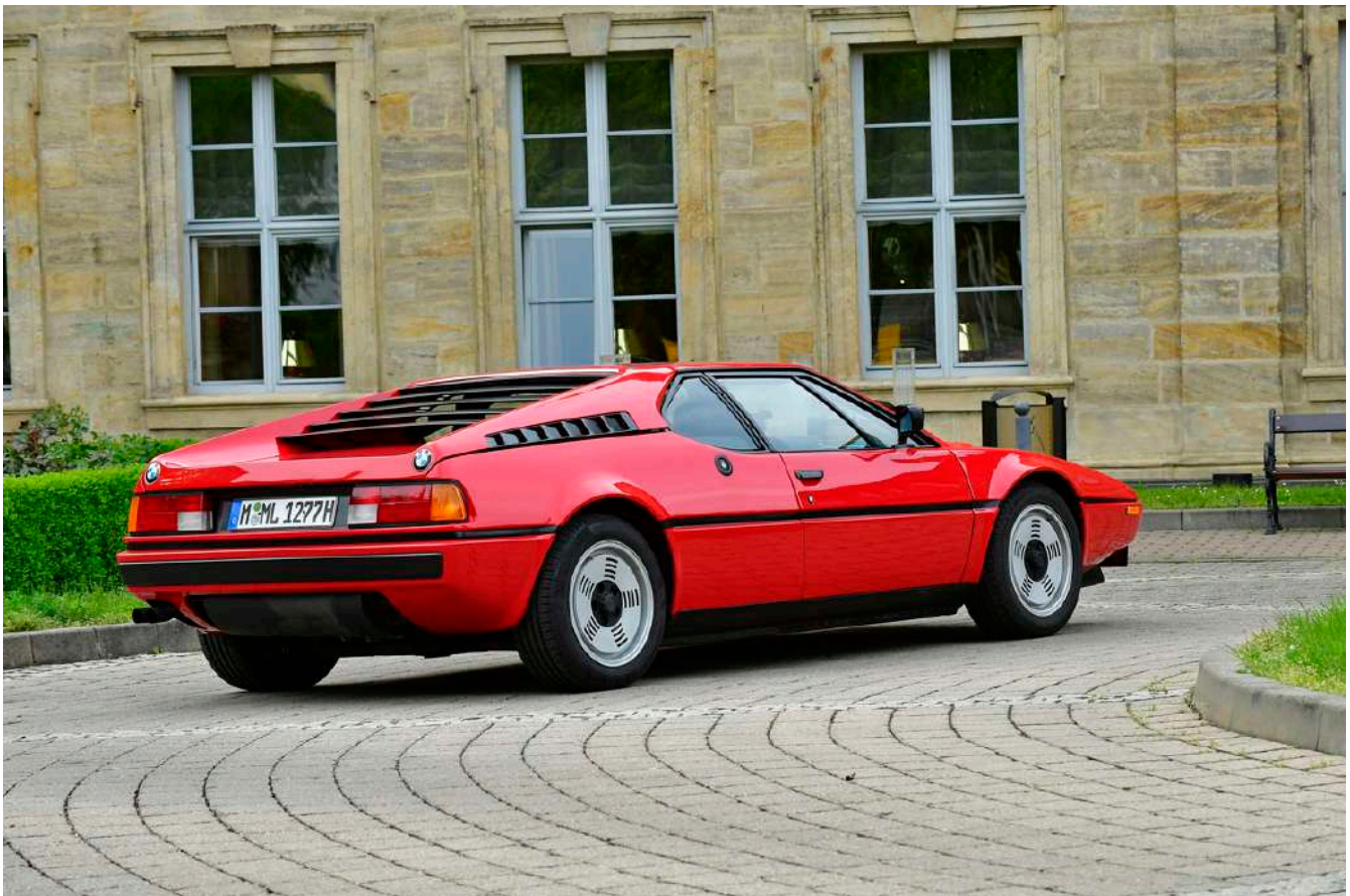
BMW M1 E26

The BMWCCB - BMW Car Club Brasil, was founded in November 1999, in São Paulo, by car fans of the German brand BMW, initially creating the Cars division within the already existing BMW Clube do Brasil Motorcycle Club, now BMW Motorrad Clube Brasil.